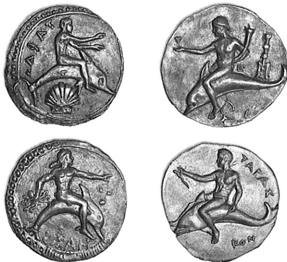
Tarentum was one of the most prolific producers of coinage in the middle centuries of the Greek empire and it flourished for nearly 500 years before it was destroyed by the Romans c. 207 B.C. Like most cities, Tarentum chose to place symbols of its city and its founder on the faces of its coins, examples of which are on display in this exhibit.