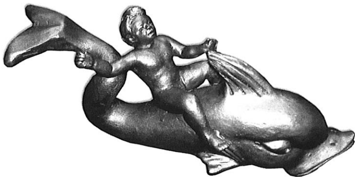
Boy Riding Dolphin, miniature bronze from the Athenian Accropolis, 5th century B.C. original in the national Archaeological Museum, Athens.