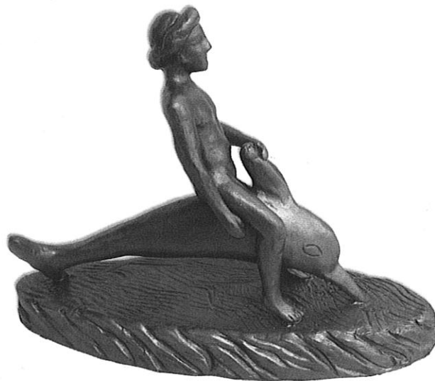
A 2nd century A.D. bronze sculpture of Eros (Roman Cupid) riding a dolphin, original in the Ephesus Museum in Selcuk, Turkey.