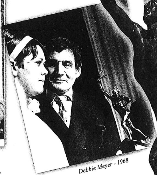
Debbie Meyer - 1968

Since 1980 the Sullivan Award has been presented to the athlete who demonstrates the best qualities of leadership, character, sportsmanship on the field as well as his or her leadership skills & strong character which is evident in his/her lifestyle as a whole.