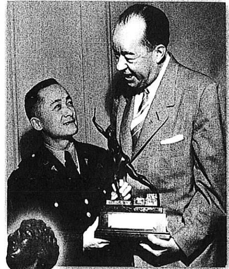
Sammy Lee - 1953