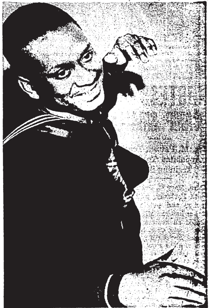
CHARLES JACKSON FRENCH

Down in history will go the sensational feat of this black sailor, who swam six hours through shark-infested waters in the South Pacific towing the raft-load of wounded sailors to the shores of the Solomons Islands after the destroyer Gregory was sunk by Jap bombs. French today is back on the high seas again.